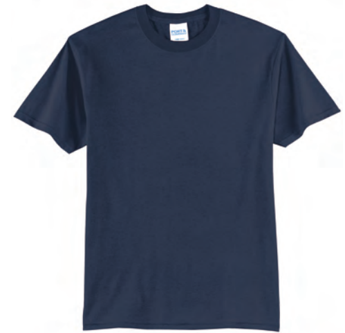
PC61 LPC61 (WOMEN'S) Port & Company® Essential Tee