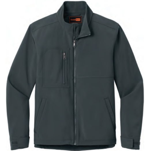
CSJT22 Red Kap® Slash Pocket Jacket