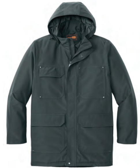
CT102199 Carhartt® Crowley Soft Shell Jacket