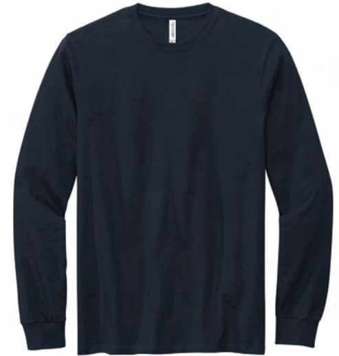
DM130 District® Perfect Tri® Tee