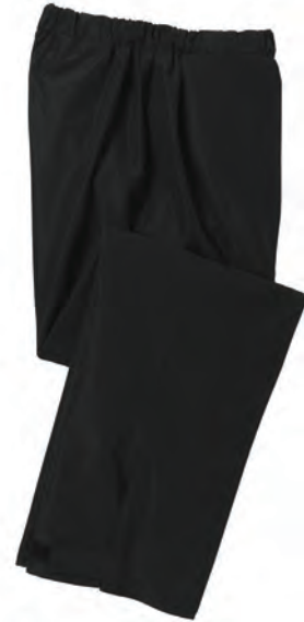
PT333 Port Authority® Torrent Waterproof Pant