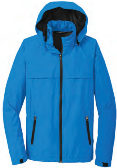
J333 L333 (WOMEN'S) Port Authority® Torrent Waterproof Jacket